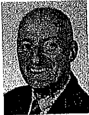
Mr Jacek KURZĘPA

EU Affairs Committee; Public Administration and Home Affairs Committee Law and Justice (Prawo i Sprawiedliwość) – ECR