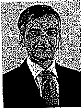
Mr Simon BUSUTTIL Partit Nazzjonalista - EPP