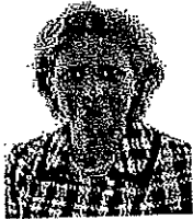
Ms Margareta CEDERFELT Committee on Foreign Affairs The Moderate Party - EPP