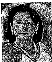
Ms Constança URBANO DE SOUSA European Affairs Committee PS - S&D